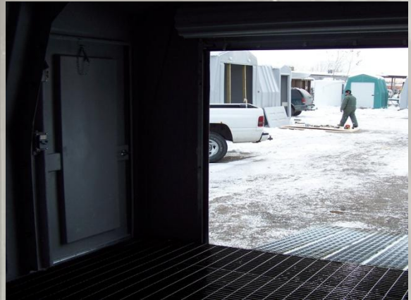
Inside view, looking out of a secondary containment building