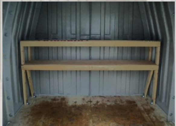
Many accessories available including shelving

FOR MORE INFORMATION OR A QUOTE ON YOUR BUILDING PLEASE CONTACT US AT 403-236-7738